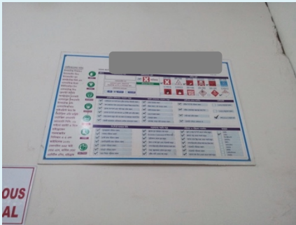
Improvement of chemical storage: MSDS used in chemical storage