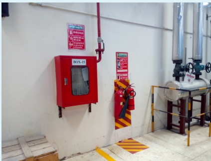
Improved fire safety: Installed fire fighting equipment unblocked