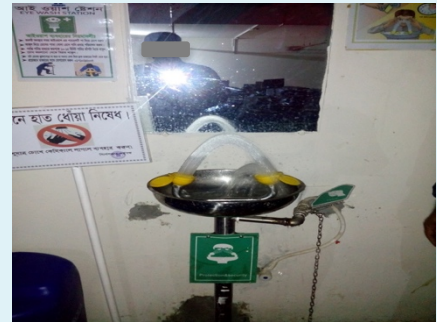
Improved Health & Safety: Installed eye wash station in chemical store